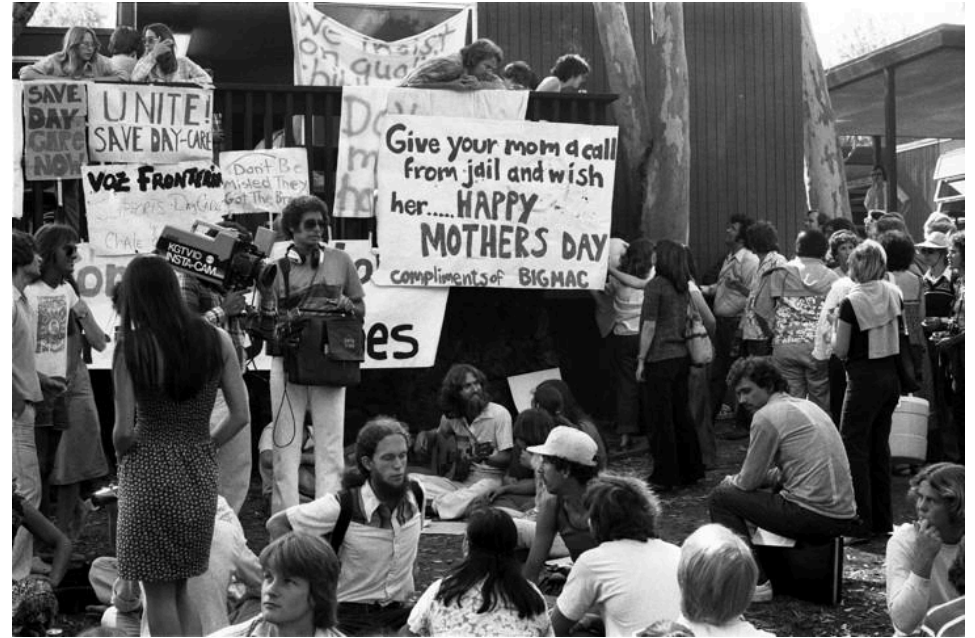
(UCSD Organizing Party in the 70s)